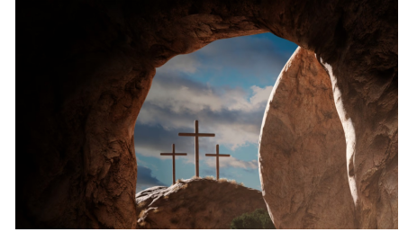
PLANS TO JOIN US!

We're already looking forward to these Easter worship opportunities: